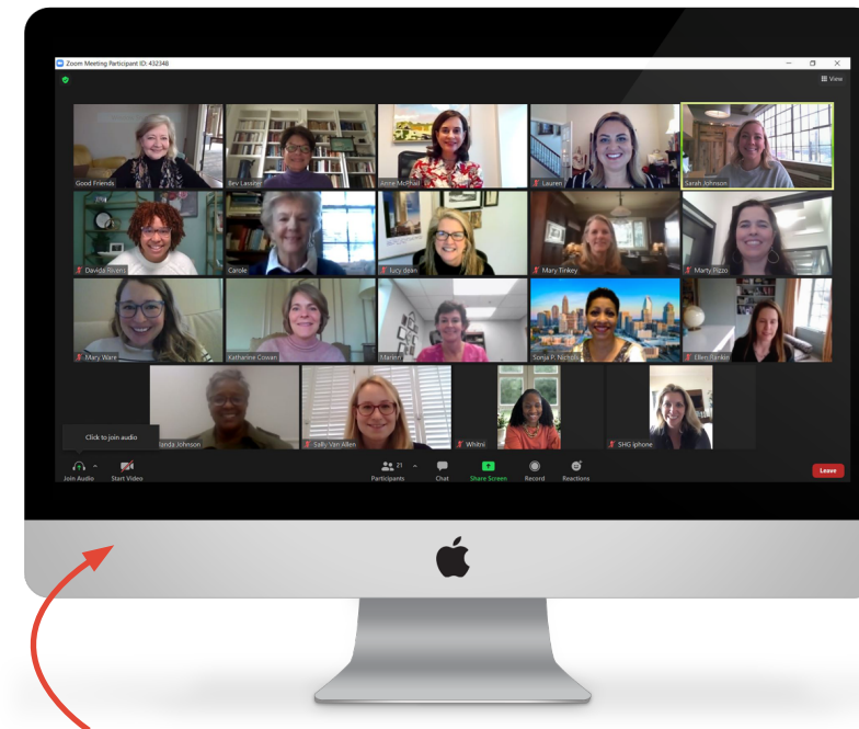
In 2020, board meetings looked different but the hard work didn't stop.